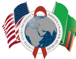
ZAMBIANS AND AMERICANS IN PARTNERSHIP TO FIGHT HIV/AIDS