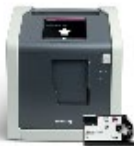
ALERE 3 HIV-1/2 DETECT

Our HIV solutions enable actionable decisions to be made that have a powerful impact on people, governments, and society. With a leading set of solutions for screening, monitoring, management and connectivity – from the lab to the point of care, Abbott is providing crucial tools to healthcare providers, especially in resource-limited settings.